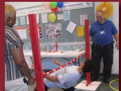
A resident enjoys doing the limbo during our summer family night gathering.