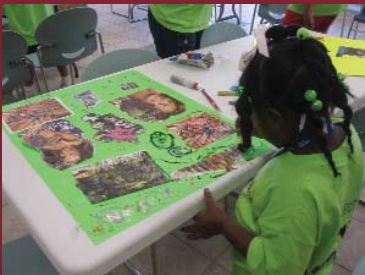
An Adventure Summer Camper working on a vision board.