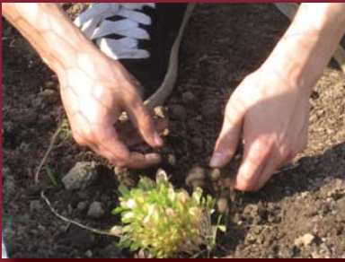
A resident planting lettuce in Campagna's community garden.