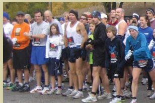
Runners gather at the start line for the start of the 4th annual Run for the Roses.