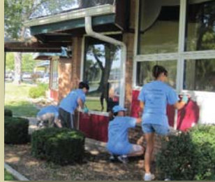
A group of volunteers from Citizens Financial Bank volunteer their time painting cottage three.

and building dreams. Special thanks to Cardinal Building Maintenance, BEHR Paint, Hammond Civic Center and BP for donating materials enabling this project to come to life.