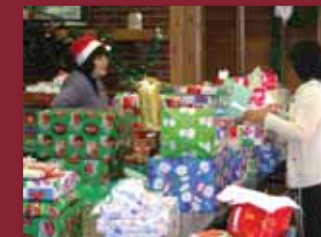
Campagna staff sort presents from local churches and community members.