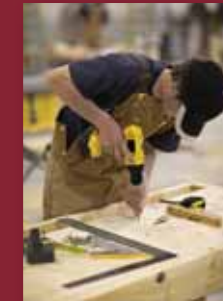
Learning vital hands-on construction skills.